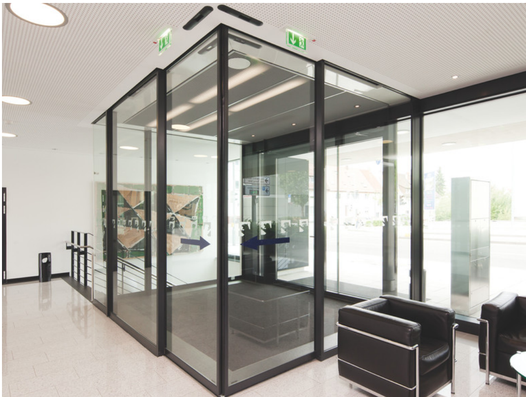
Automatic sliding door system for use on angled façades or corners